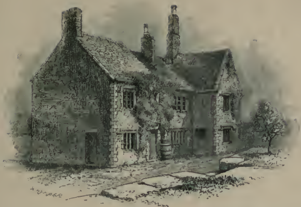
PEEL FOLD, OSWALDTWISTLE—THE OLD HOME OF THE PEELS